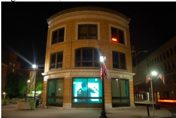
Luo Yong's Dream Laurie McLeod digital video projected in site-specific sites - 2004