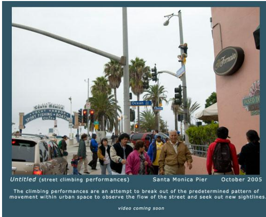
Untitled (street climbing performances) – Santa Monica Pier Nancy Popp photo document of performance - 2005