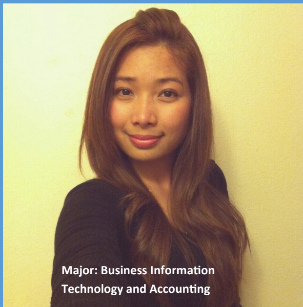
Major: Business Information Technology and Accounting